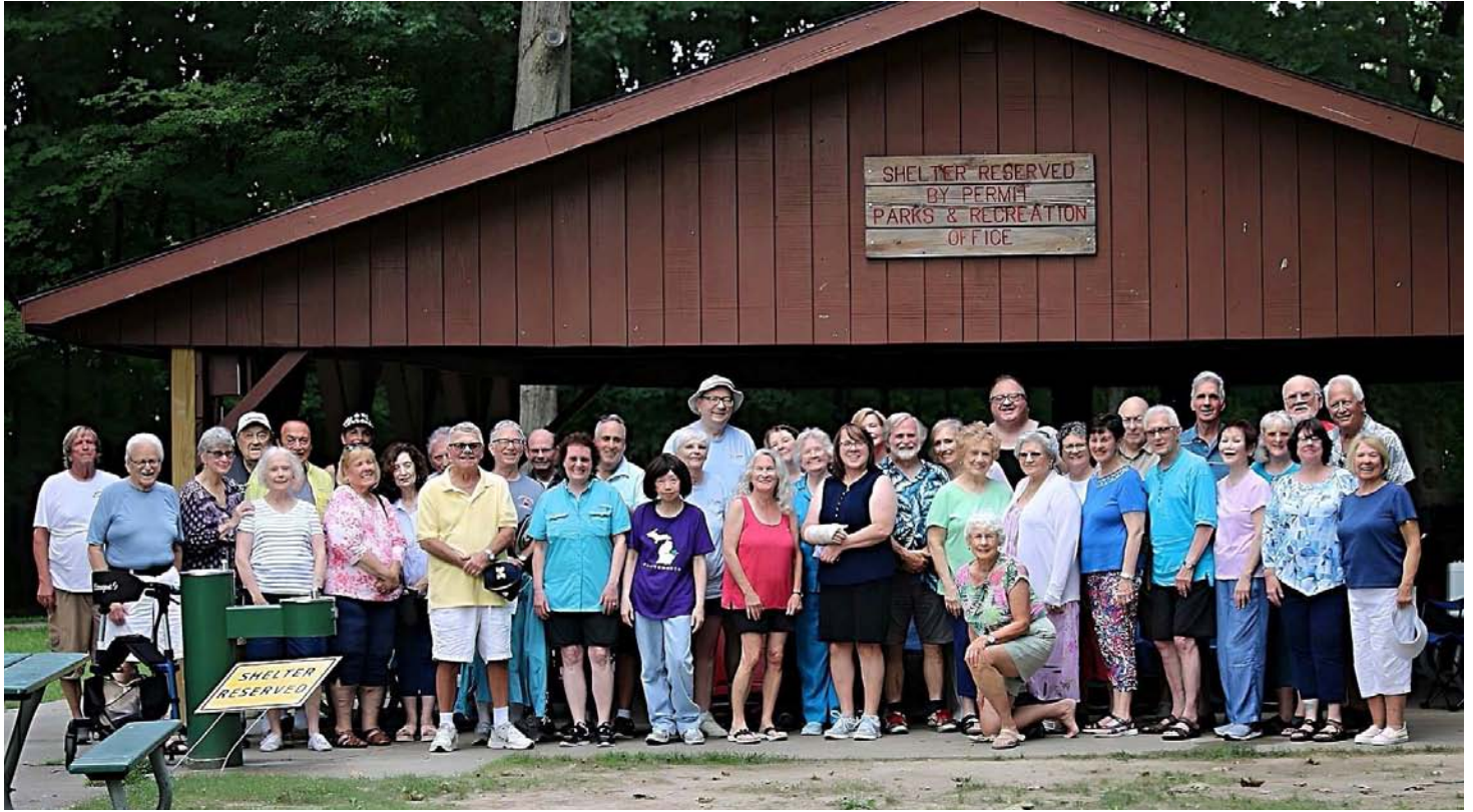
Group Photo Of HOH Picnic